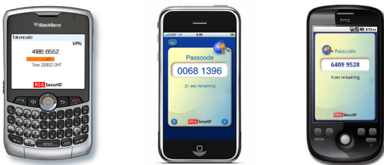
RSA SecurID software tokens for smartphones

RSA SecurID software tokens are available for a variety of smart phone platforms including BlackBerry®, iPhone®, Android®, Nokia®, Windows® Mobile, Java™ ME, and Symbian OS and UIQ devices.