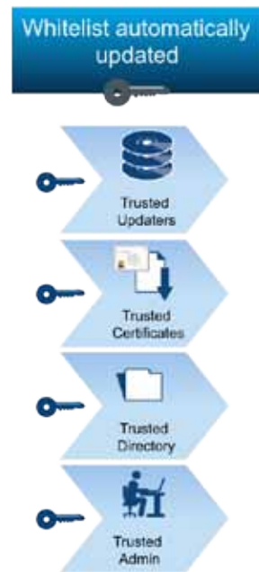
Figure 2. Secure update flow.

McAfee Application Control software includes a suggestions interface that recommends new update policies based on execution patterns at the endpoints. It's an excellent way to manage exceptions generated by blocked applications. Simply inspect the exceptions and the details of the blocked application. Then, either approve and whitelist the file or ignore it when the application is meant to be blocked.