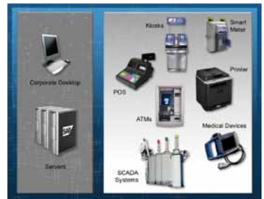
Figure 1. In addition to desktops and servers, McAfee Application Control software extends protection to fixed-function devices to significantly reduce consumer risk.

McAfee® ePolicy Orchestrator® (McAfee ePO™) software consolidates and centralizes management, providing a global view of enterprise security—without blind spots. This award-winning platform integrates McAfee Application Control software with McAfee Risk Advisor, McAfee Host Intrusion Prevention, McAfee Firewall, and other McAfee security and risk management products. In addition, McAfee ePO software can easily embrace products from McAfee Security Innovation Alliance Partners, as well as your home-grown management applications.