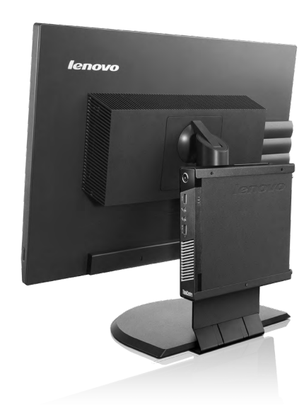
THINKCENTRE® M93P TINY